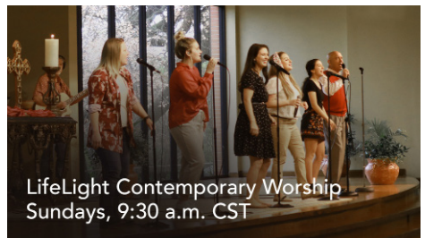
LifeLight Contemporary Worship Sundays, 9:30 a.m. CST