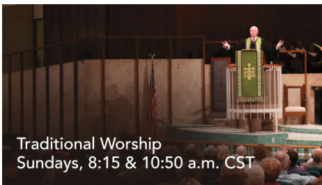
Traditional Worship Sundays, 8:15 & 10:50 a.m. CST

If this is your first time at St. Luke's, we would like to invite you to join us for Sunday Morning Worship.