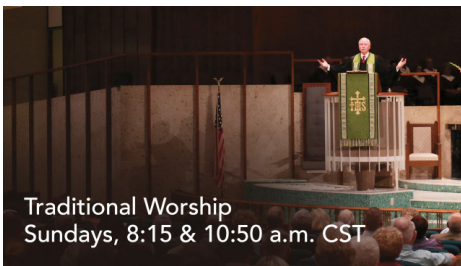
Traditional Worship Sundays, 8:15 & 10:50 a.m. CST

If this is your first time at St. Luke's, we would like to invite you to join us for Sunday Morning Worship.