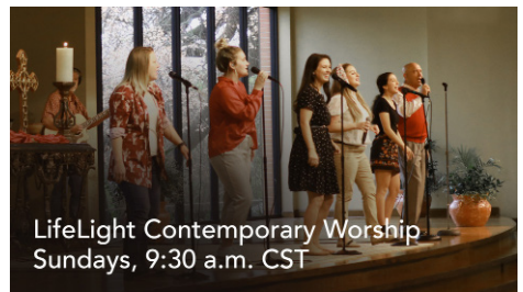
LifeLight Contemporary Worship Sundays, 9:30 a.m. CST