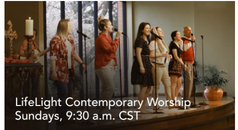
LifeLight Contemporary Worship Sundays, 9:30 a.m. CST