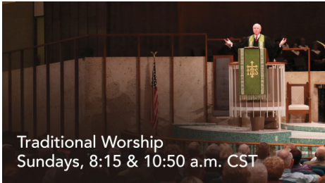
Traditional Worship Sundays, 8:15 & 10:50 a.m. CST

If this is your first time at St. Luke's, we would like to invite you to join us for Sunday Morning Worship.