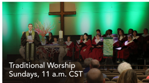
Traditional Worship Sundays, 11 a.m. CST