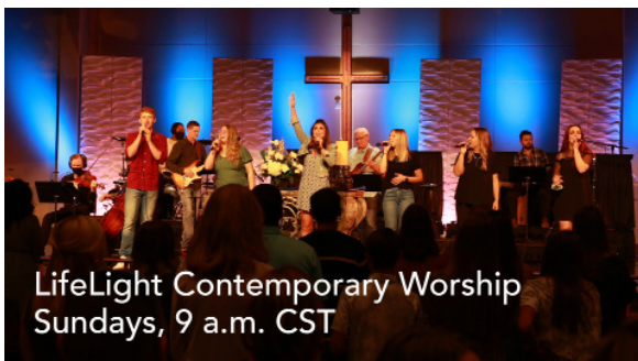
LifeLight Contemporary Worship Sundays, 9 a.m. CST

If this is your first time at St. Luke's, we would like to invite you to join us for Sunday Morning Worship.